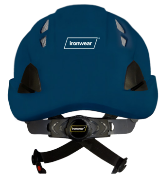
Back - Ratchet