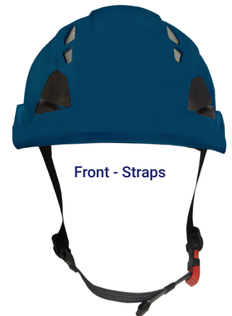
Front - Straps