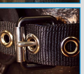
Anodized Aluminum Tongue Buckles