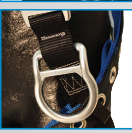
Aluminum Positioning D-Rings (802000)