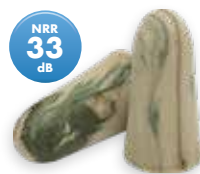
Camo Plugs® 40 Pairs (80 plugs)