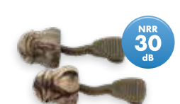
Glide® Camo Foam 50 Pairs (100 plugs)