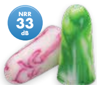
SparkPlugs® 40 Pairs (80 plugs)