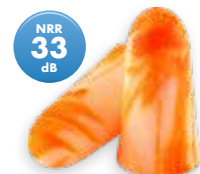
Softies® 40 Pairs (80 plugs)