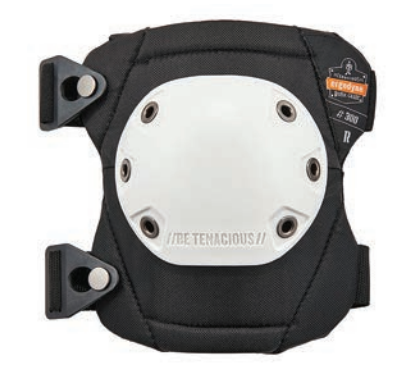
Ergodyne ProFlex<sup>®</sup> 300 Rounded Cap Knee Pad